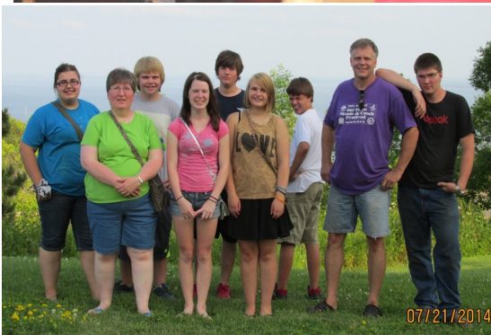
Wildfire Youth Mission Trip