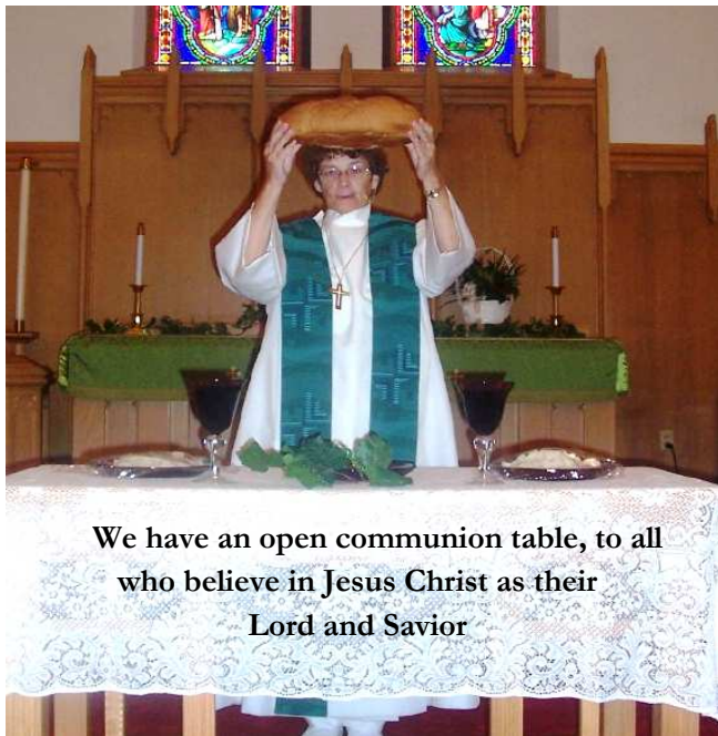
We have an open communion table, to all who believe in Jesus Christ as their Lord and Savior

Sunday School for ages 3yrs through adults @ 9:00 am-10:15 am